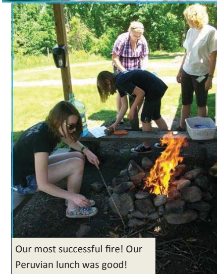
Our most successful fire! Our Peruvian lunch was good!

We arrived at Heifer International's Outlook Farm in MA just in time for a veggie pasta supper, farm raised meatballs, fresh garden variety salad, garlic bread, and beet cake! Skeptical, students soon learned how tasty farm cooking really is! While touring the grounds. We found sweet guinea pigs to hug, then played charades 'til bedtime!