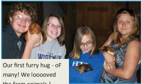
Our first furry hug - of many! We looooved the farm animals !

Co-Op Youth Sunday was during a very busy time of year. Four stalwarts not required elsewhere were able to present a version of The Lord's Prayer, sign "Testify to Love", & present youth-created slideshow of our winter retreat themed "Finding Rest in our Rest-Less World" to PBBC.