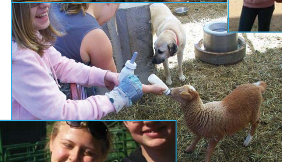
Bottle feeding lambkins & "running" goats to pasture.

Our windy mountaintop first night was coooool sleeping in our tent. Our sleep was interrupted by 4:30am rooster 'alarm'. Eventually we admitted morning, packed up and all chipped in to make our own farm yummy breakfast!