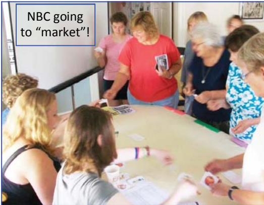
NBC going to "market"!