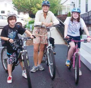
As always - simple beginnings at NBC!