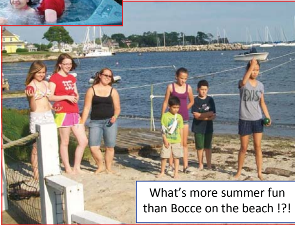
What's more summer fun than Bocce on the beach !?!

Heifer Presentations! We offered presentations to both NBC (Early Morning Service) & PBBC (Second Hour) to the delight of many!! We are very appreciative of each congregation's interests. In turn, our experiences were meaningful, providing lasting memories. We think each congregation received something to think about as well via two activities we were taught at Heifer. Purchasing a Pasta Supper with $10 of tokens from large a supermarket, mom & pop shop or a farmer's market...An aspect we learned is about Community Supported Agriculture (CSA) a term coming of age. Each had different amounts of payback to the community. Another exercise was World Population vs Personal Wealth where we attempted to correctly portion each using 100 tokens ... Another eye opener! Thank you for your support!