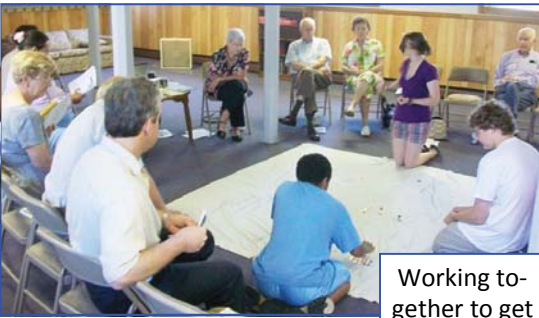
Working together to get the big picture of our World Map!