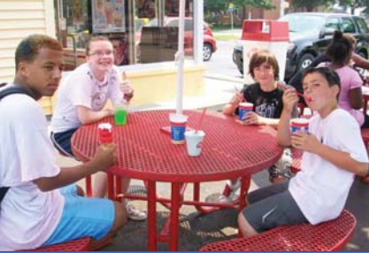
Can Ice cream ever taste any better?