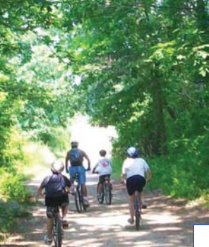
I used to be able to keep up with them easily !?!?