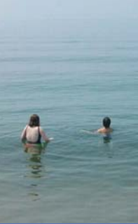
Heavy, hot, thick fog - we felt like we were nowhere!