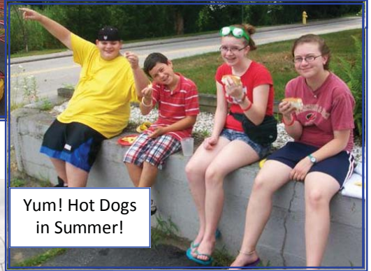
Yum! Hot Dogs in Summer!