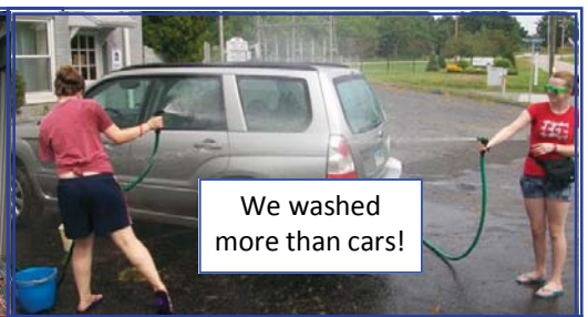
We washed more than cars!