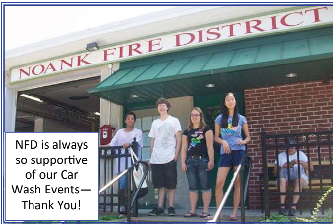
NFD is always so supportive of our Car Wash Events— Thank You!