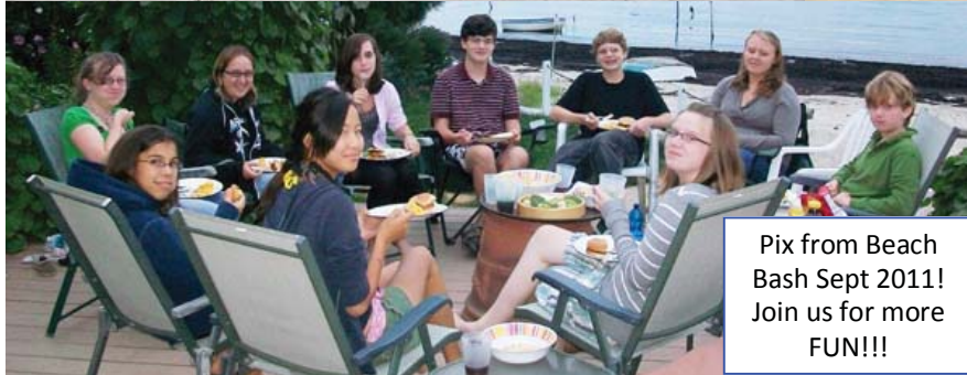
Pix from Beach Bash Sept 2011! Join us for more FUN!!!

Fri. Sept 9 Beach Bash 5:00 - 8:00pm at 99 Noble Ave., Noank... As a kick off to this school year, let's gather at the beach to play volley ball, badminton, hang out in the hot tub, share a meal, good conversation and a maybe a campfire!?! Bring a friend,