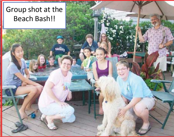
Group shot at the Beach Bash!!