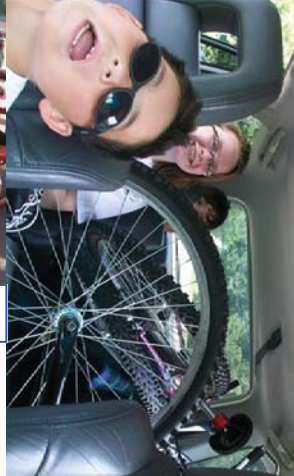
A bit tight - but safe! Yes - this photo is sideways!

Car Washes We want to thank the Noank Fire House again