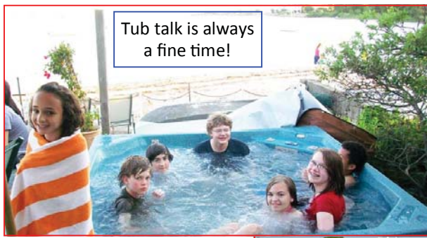
Tub talk is always a fine time!